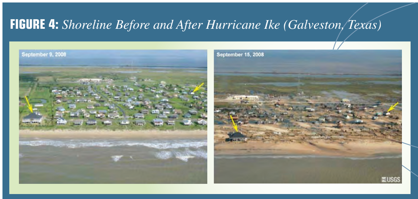
These photos shows the movement of the vegetative line before and after Hurricane Ike. Source: U.S. Geological Survey - Bolivar Peninsula, Galveston, Texas. Used with permission.