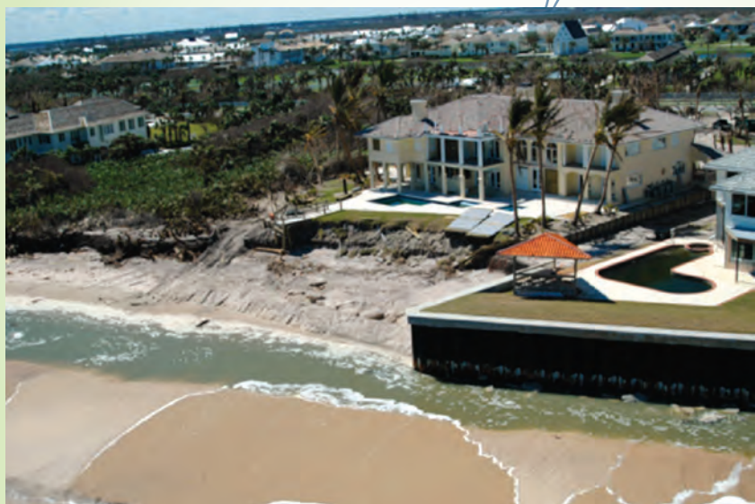
FIGURE 1: Sea Walls (Dothan, Alabama)

The sea wall on the right reflects wave energy and exacerbates erosion on the adjacent properties.